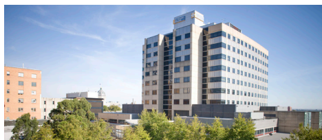
St Vincent's Fitzroy campus in 2012.

Brochure produced in Melbourne's centenary year publicizing the newly opened hospital wing on Victoria Parade (Healy Wing).